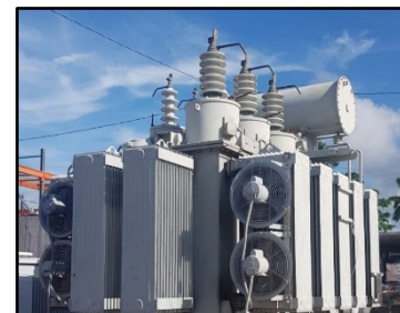
Transformer Replacement at Orange Walk Substation

BEL apologizes for the inconvenience caused and reaffirms its commitment to delivering safe and reliable service. We encourage the public to report any hazards or damages to the power system by calling 0-800-BEL-CARE / 0-800-235-2273.